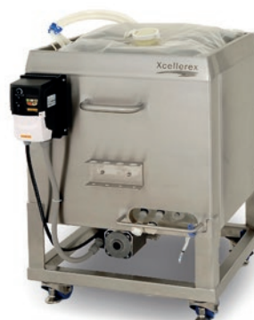
Fig 3. XDM Quad Mixing System, with a powerful motor and magnetically locked impeller, effectively mixes even highly viscous materials.

Our RRP program manufactures up to 200 L of your custom prototype formulation within seven working days of your request. Use our RRP service to expedite the development and testing of custom media for your biopharmaceutical manufacturing process.