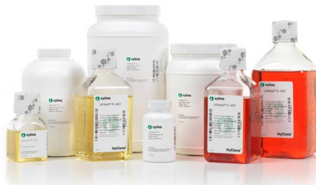
Fig 1. ActiPro, ActiSM, and Cell Boost 7a and 7b are designed for high yields of recombinant proteins in fed-batch culture processes with CHO cells.

The supplements should be added to the cultivation vessel as individual solutions and should not be mixed in advance as this will cause precipitation. The recommended ratio of Cell Boost 7a to 7b is 10 to 1 (v/v) (example feeding strategy Cell Boost 7a at 3% and Cell Boost 7b at 0.3%). The total amount of feed added and the specific feeding regime will need to be adjusted according to the nutritional requirements of each specific clone. The supplements are available as a powder or in a ready-to-use liquid format for research and process development. The liquid feed supplements meet testing specifications and are stable up to 12 months in PETE bottles and 9 months in bioprocessing bags at 2°C to 8°C (Fig 2).